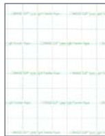
Transfer Sheet Laser Light