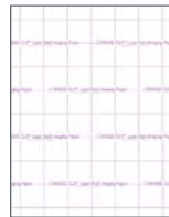
Imaging Sheet Laser Dark