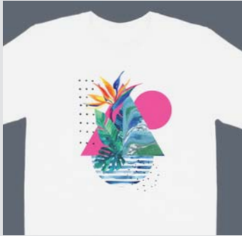
Produced with: IMAGE CLIP® Laser Light