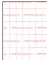
Imaging Sheet Laser Light

IMAGE CLIP® Laser Light (9770P0) & Laser Dark (9849P0) Heat Transfer Papers are designed for the heat transfer of full color images with fuser oil or oil-less laser color copiers or color laser printers to light, white, dark, or black fabrics. There is no need to trim the paper. IMAGE CLIP® Transfer Papers are self-weeding and leave no background plastic polymer yet produce a soft, pliable, and highly durable product.