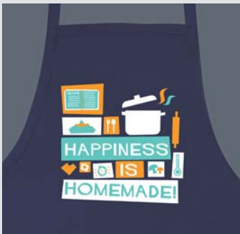
Produced with: IMAGE CLIP® Laser Dark