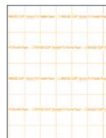
Transfer Sheet Konzert-Ts