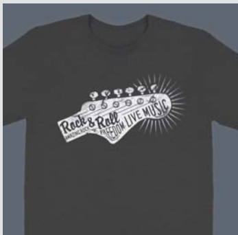
Produced with: IMAGE CLIP® Konzert-Ts