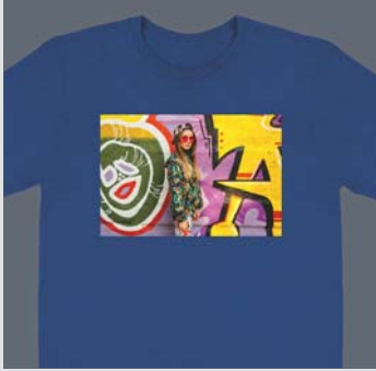
Produced with: LASER-1-OPAQUE®