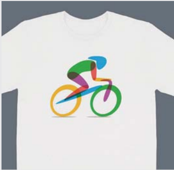
Produced with: JET-PRO® Active Wear Paper