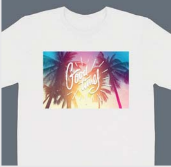
Produced with: JET-PRO® SS Paper