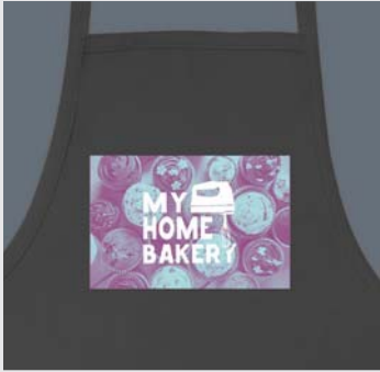
Produced with: 3G JET OPAQUE® Paper